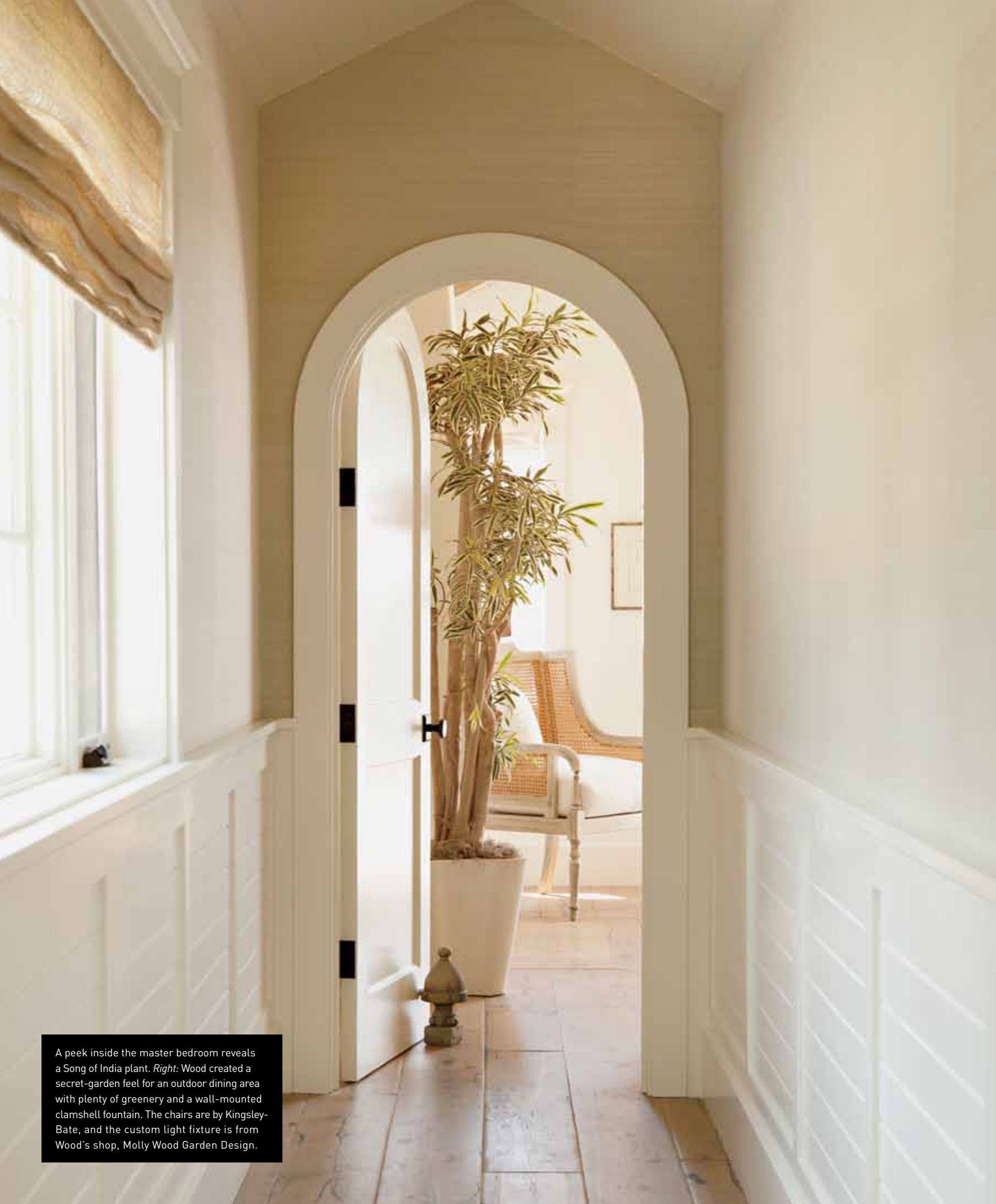
A peek inside the master bedroom reveals a Song of India plant. Right: Wood created a secret-garden feel for an outdoor dining area with plenty of greenery and a wall-mounted clamshell fountain. The chairs are by Kingsley-Bate, and the custom light fixture is from Wood's shop, Molly Wood Garden Design.