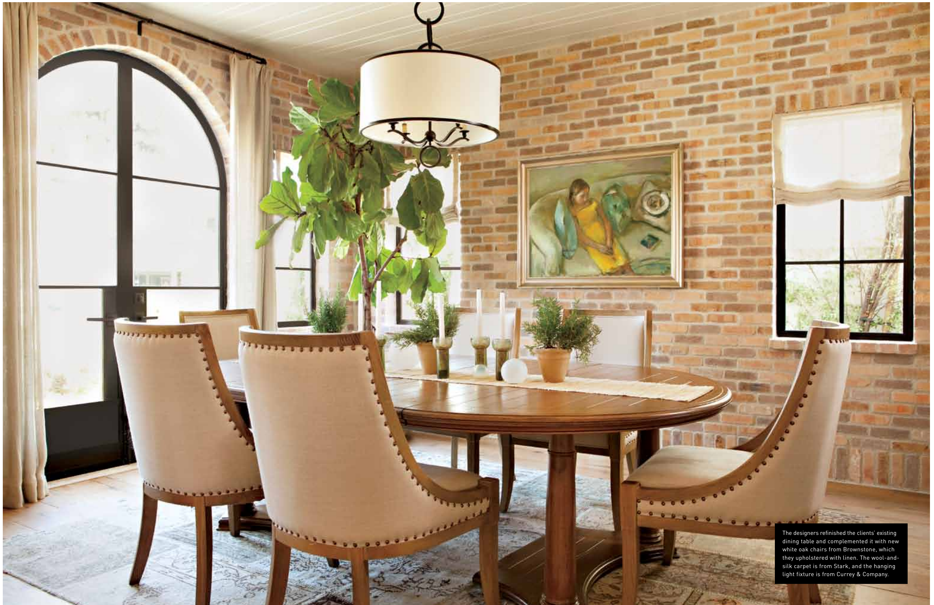
The designers refinished the clients' existing dining table and complemented it with new white oak chairs from Brownstone, which they upholstered with linen. The wool-and-silk carpet is from Stark, and the hanging light fixture is from Currey & Company.