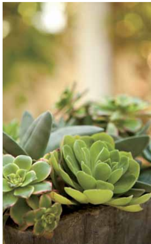
Above: Architect Cynthia Childs designed built-ins for the mudroom, and throughout, to lend character and function. Right: Wood utilized succulents, including aeoniums and crassula, for color and graphic impact.