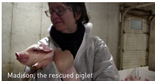
Madison, the rescued piglet