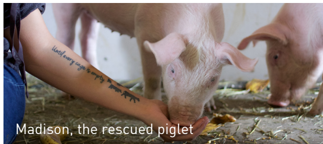
Madison, the rescued piglet