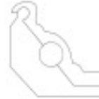
Standard 5/8" 15mm clearance