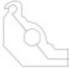
High Lift 1/2" 17mm clearance