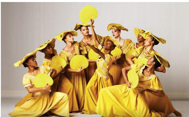
The Company in Revelations