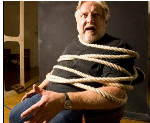
In rehearsal for Deathtrap

He is currently appearing in the Ira Levin's Death Trap . The run continues until Saturday 26th January 2011.