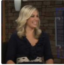
Fox Charlotte's "Reboot Charlotte" tells the story of our city in transition