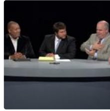
Mecklenburg County 2011 election wrap-up, on the latest State of Mecklenburg