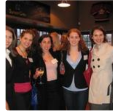
YWCA Central Carolinas launches 1902 Society, focused on volunteerism, philanthropy & civic engagement