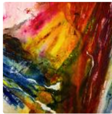
CLT Out & About: Nov 2-4 & 6