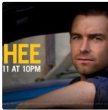
Banshee, the latest TV show filmed in Charlotte, premieres Friday @ 10