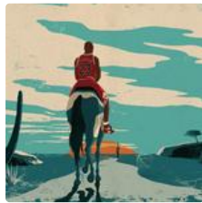
Awesome profile of Michael Jordan in this month's issue of ESPN The Magazine