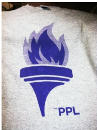
The PPL will give away T-shirts at Tuesday's event.

Here's your chance to meet The PPL . You could be a part of The PPL.