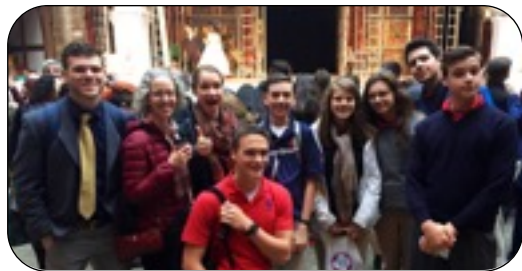
St. Timothy students England trip more photos on St. Timothy School's Facebook page