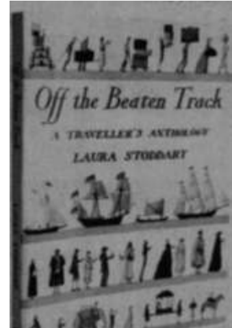
Off the Beaten Track by Laura Stoddart, Orion ($21.95). A Traveller's Day Book ($26.95).