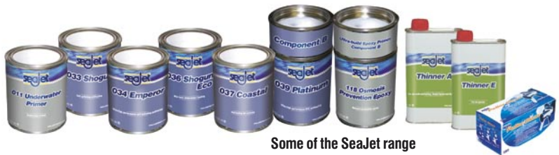
Some of the SeaJet range