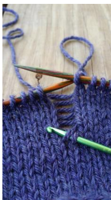
Repairs & Remedies

One Project + wrap-up $20 + materials All 3 Projects $55 + materials