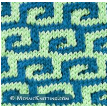
Mosaic Shawl KAL