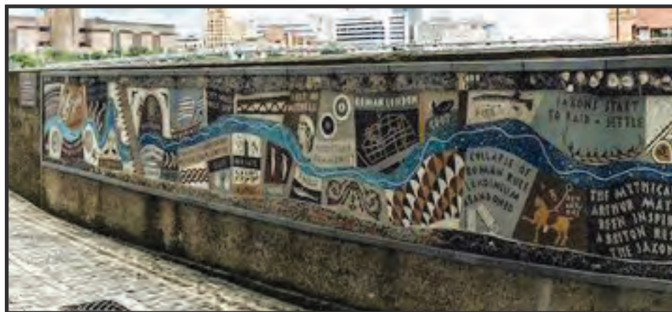
Our model is the Queenhithe Dock Mosaic in London

Our historical research and design process is underway with the help of many scientists and experts.