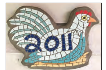
Sample perk: custom house number