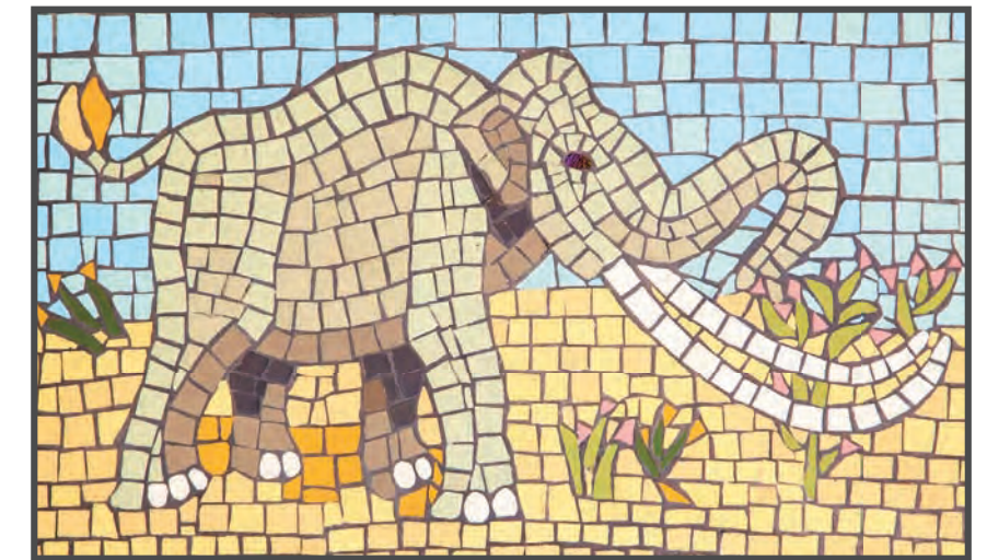
Pygmy mammoths lived on Santa Rosa Island 100,000 years ago.