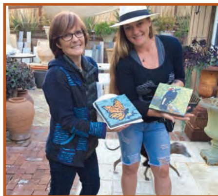
London School of Mosaic workshop at Menelli Trading Co. Montecito.

Help create a 50 foot mosaic which will illustrate Santa Barbara's environmental, historical and cultural events from the Jurassic Period to today. Learn to make mosaics in free bilingual public workshops.