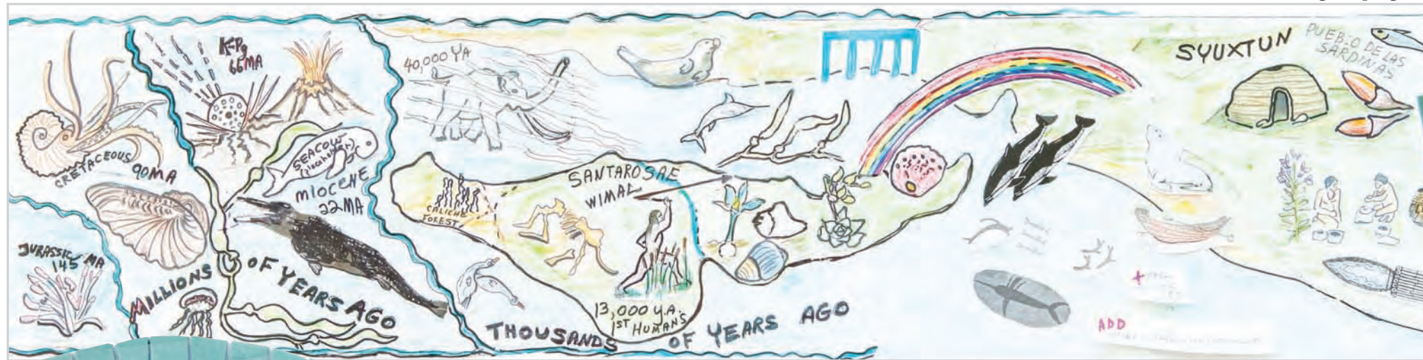
Santa Barbara's Timeline Mosaic design in progress.

Santa Barbara's history from the Jurassic Period to today.