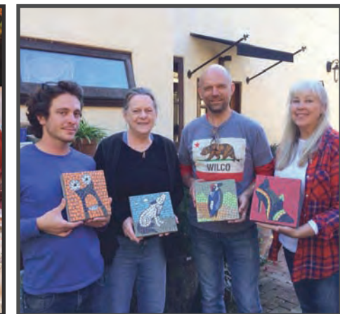
Participate in making a community mosaic to celebrate our history.

Join our free bilingual community workshops to learn how to make mosaics and help fabricate this iconic public art installation.