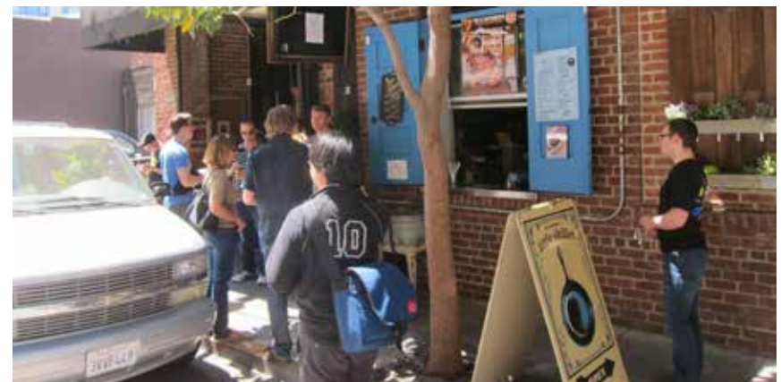
Box Kitchen, Little Skillet, SF