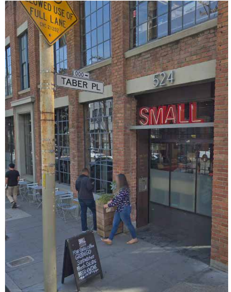
Small Foods, SF