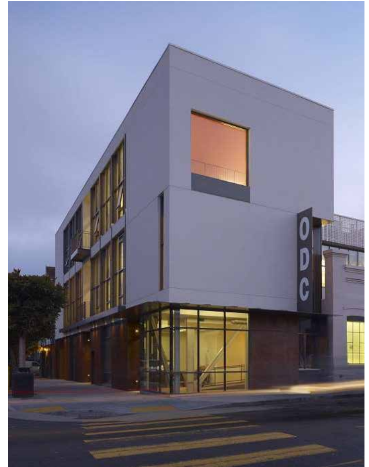
ODC Dance Commons, SF