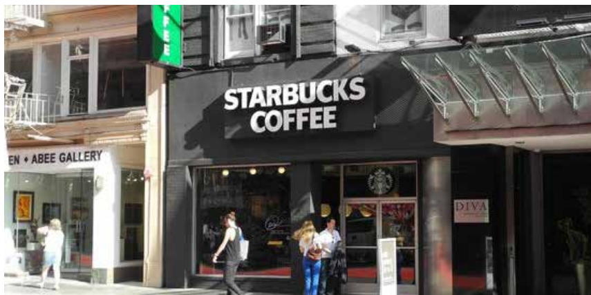
Taco Bell, Starbucks, SF