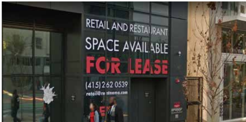
4th Street, Market Street, SF