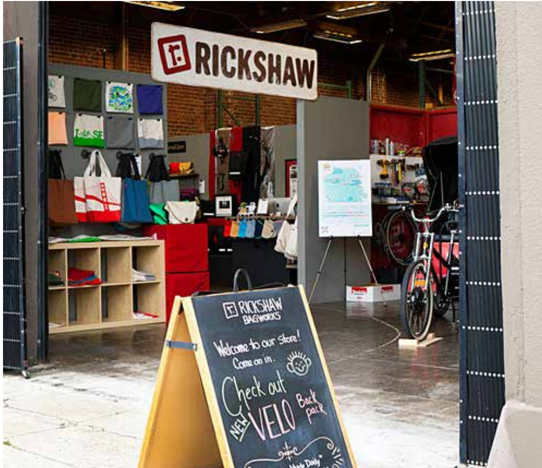
Rickshaw Bagworkss, SF