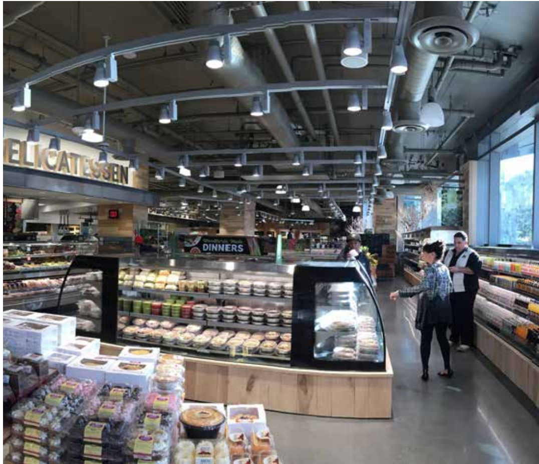
Woodlands Market, SF