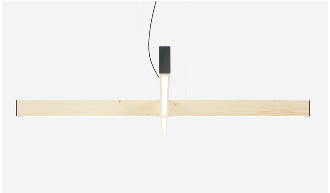
Shown: Natural, Blackened Steel End Caps (2X4PP 60 0102_25)