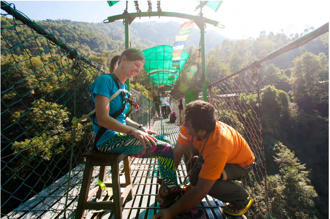
Getting ready to jump