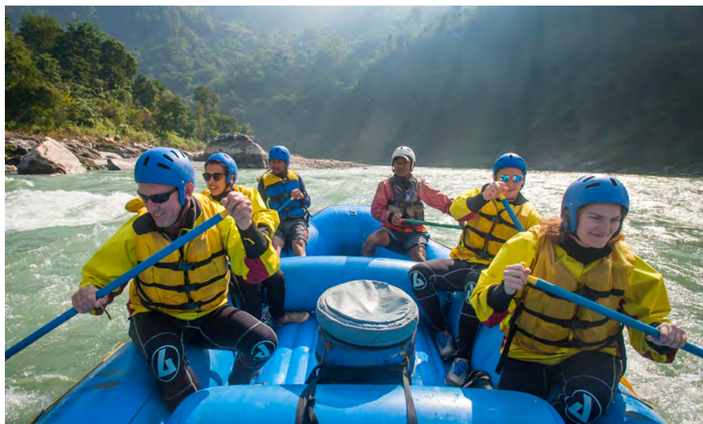
The calm before the storm

this also guarantees an oasis of privacy. With exotic landscaped gardens, the resort is uniquely crafted in local stone, wood and slate with a great dining hall complete with high-vaulted ceiling and centuries old wood carvings serving delicious buffets, you can eat inside or out on the terraces, or gardens at low tables with large square cushions.