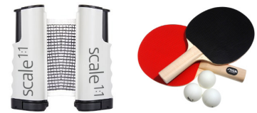
Ping-Pong Set Included

(Optional) Surface mounted power Includes (2) 3 outlet power units Jumper and Starter Cable Wall plug (custom options available)