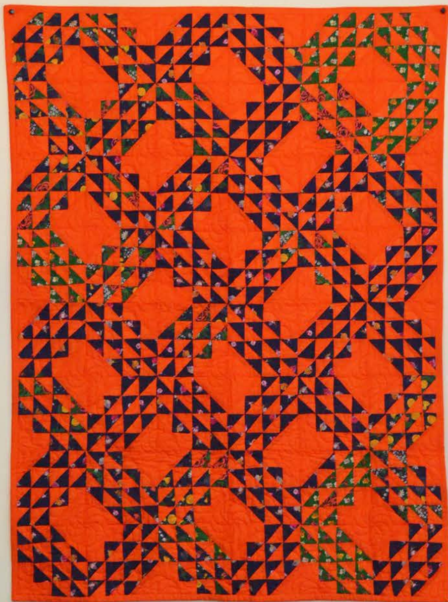
Ocean Waves Quilt by: Angela Miller, brooklynquiltingco.com

This quilt offers endless opportunity for color play. We used our brightest and most contrasting prints and solids to create a small but powerful display-sized quilt.