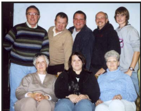
The cast of IT'S ONLY A PLAY