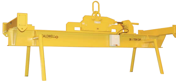
Special 4-point Posi-Leveler™ with load guides.