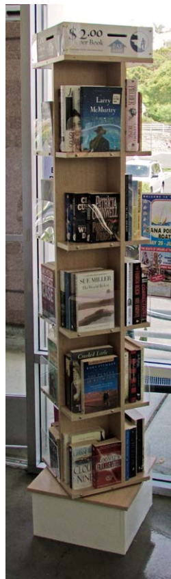
NEW BOOKSTANDS: At Dana Wharf Sportfishing (left) and at Tutor & Spunky's Deli (right).