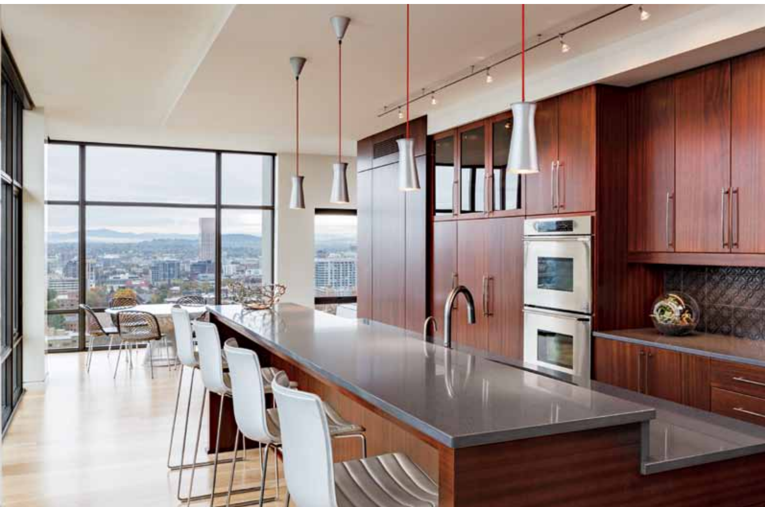
Above: Appliances from Basco settle into the kitchen with cabinetry from Euro American Design. Arper barstools found at Inform Interiors sit beneath DAB pendants from YLighting, and Matteograssi chairs surround a Knoll table in the distance. Right: The Ann Sacks backsplash offers striking texture.