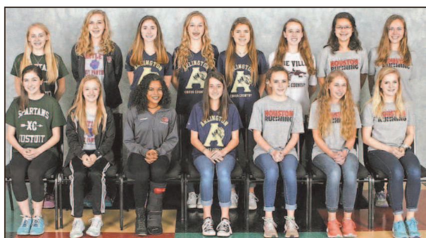
DIVISION 1 GIRLS TEAM