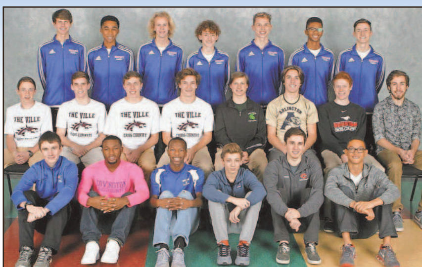
DIVISION 1 BOYS TEAM