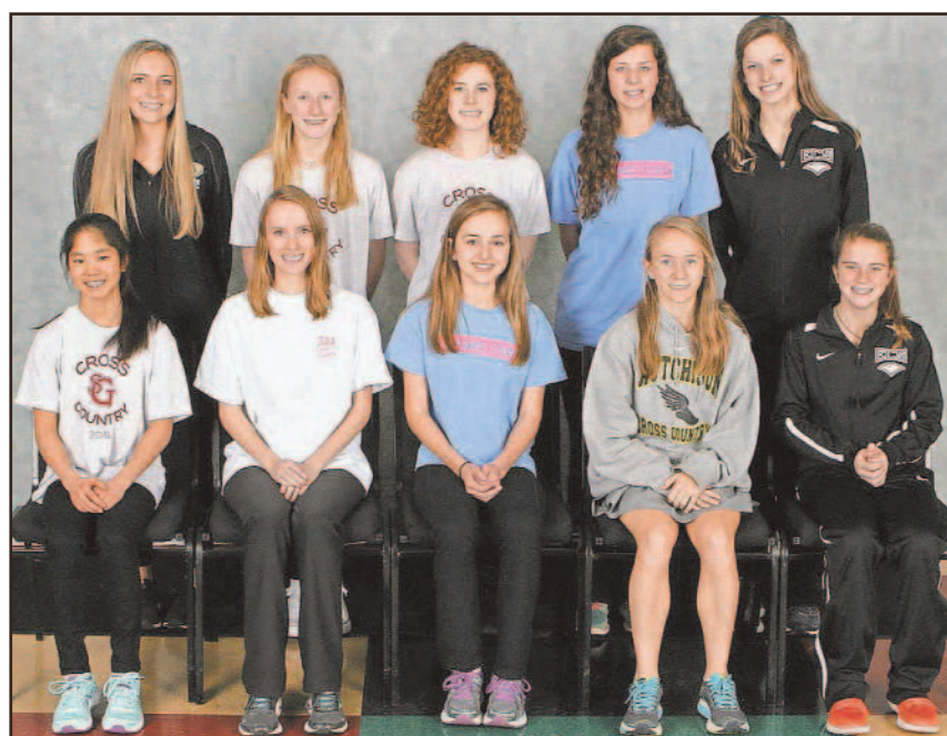
PRIVATE SCHOOLS GIRLS TEAM