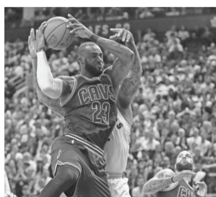
Cavaliers forward LeBron James (23) comes down with a rebound in front of Raptors forward PJ Tucker during Friday's Game 3 in the second round of the NBA Playoffs. Cleveland can finish a sweep with a victory on Sunday.

NEED TO KNOW: The NBA suspended the Wizards' Kelly Oubre Jr. for Sunday "for charging and making forceful and unwarranted contact" with the Celtics' Kelly Olynyk in Game 3. Cel-