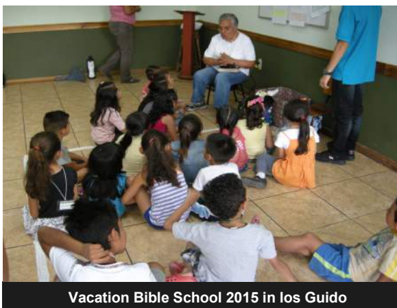
Vacation Bible School 2015 in los Guido