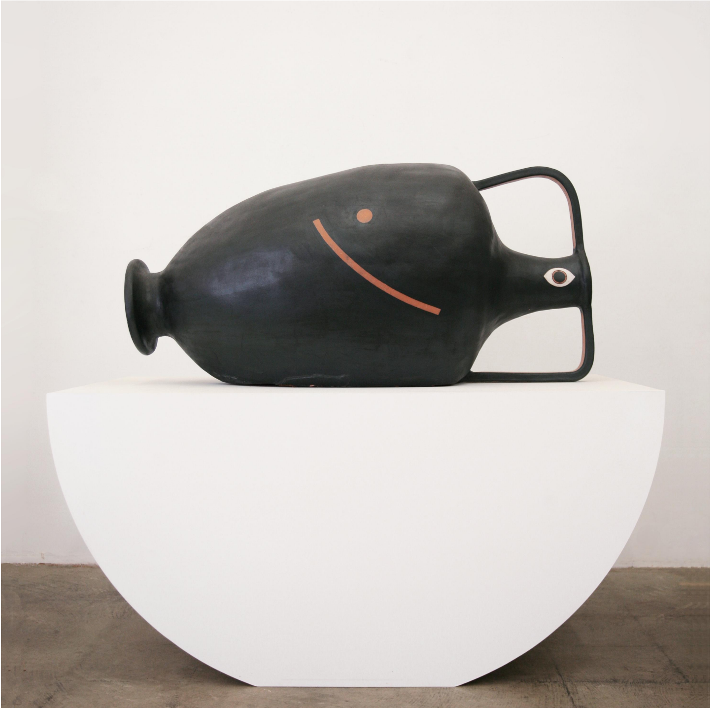
Reclining 2 Nude , 2016 Courtesy Cammie Staros and Lefebvre & Fils Gallery