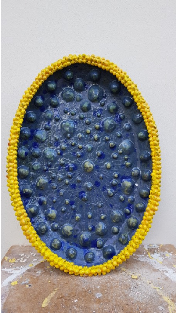
RDN#05, Untitled, 2018 Glazed ceramic, 45 x 30 x 6 cm