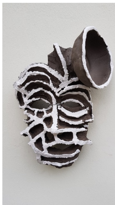
ZA#44, Untitled, 2018 Glazed ceramic, 35 x 28 cm