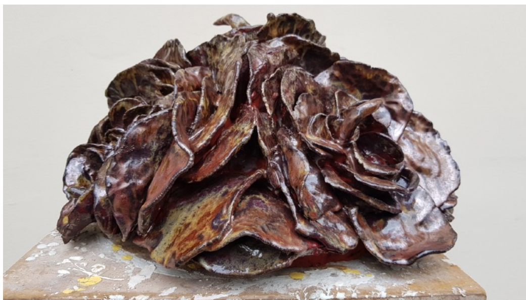
Raul de Nieves, RDN#07, Untitled, 2018, Glazed ceramic, 25 x 45 x 48 cm

Alongside this tortured and funny microcosm, Raul de Nieves seems to cultivate an abounding and colorful garden where mutant plants, half aquatic, half terrestrial, make their way.