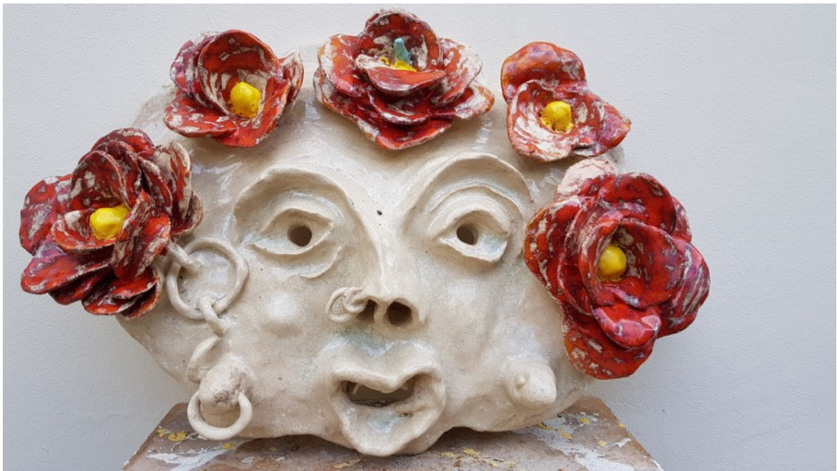
RDN#03, Untitled, 2018 Glazed ceramic, 35 x 52 cm