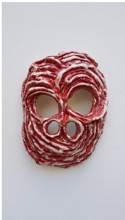
ZA#24, Untitled, 2018 Glazed ceramic, 30 x 23 cm