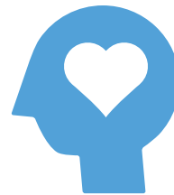
Mental and Physical Health