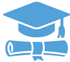
College and Career