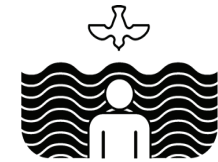
Ordinance of Baptism