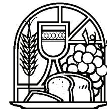
Ordinance of the Lord's Supper