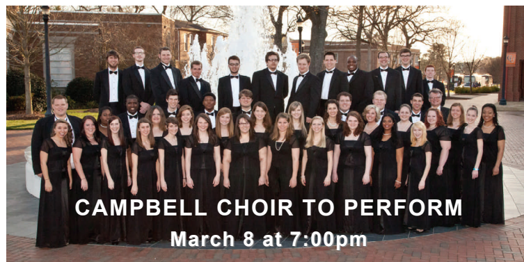
CAMPBELL CHOIR TO PERFORM March 8 at 7:00pm

Published Weekly by Edenton Baptist Church Periodicals Postage Paid at Edenton, NC 27932 Phone: 482-3217, Fax: 482-7670 Website: www.edentonbaptist.org