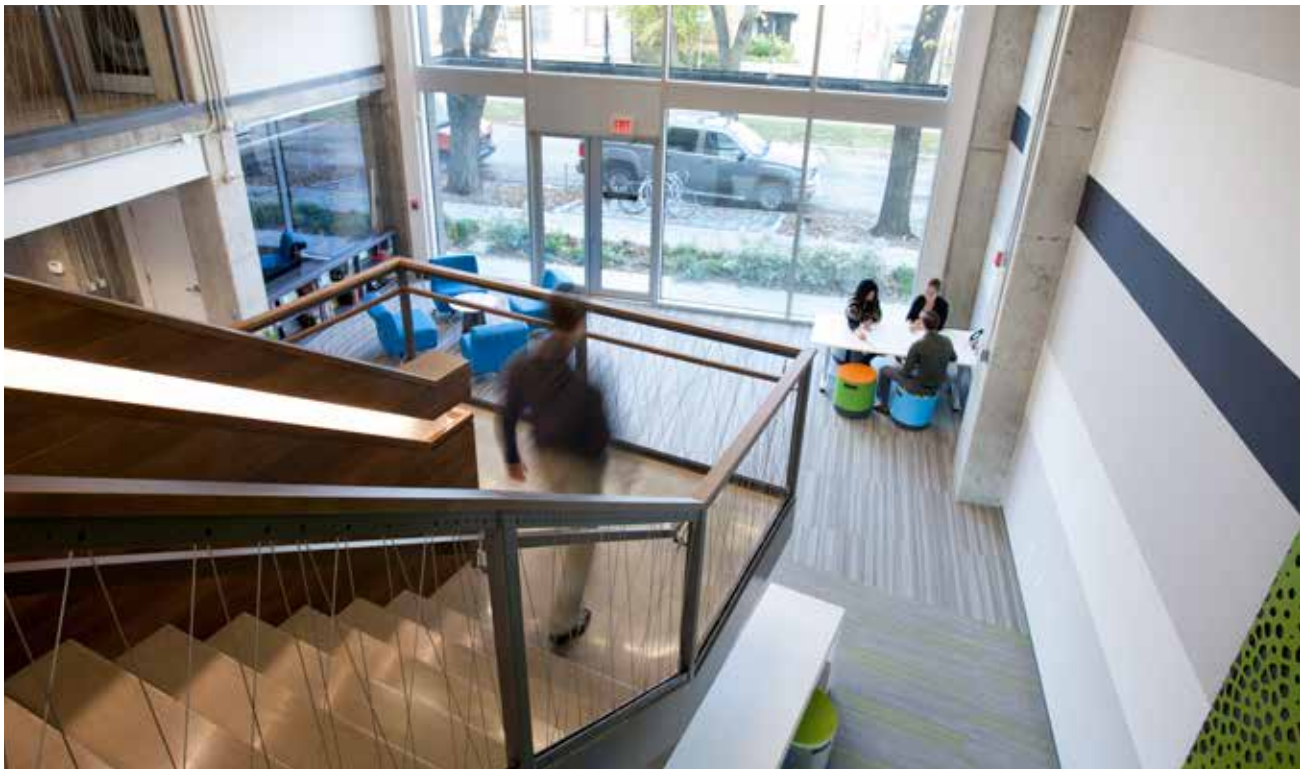
Project NextUs (Award of Excellence, Interior Design)