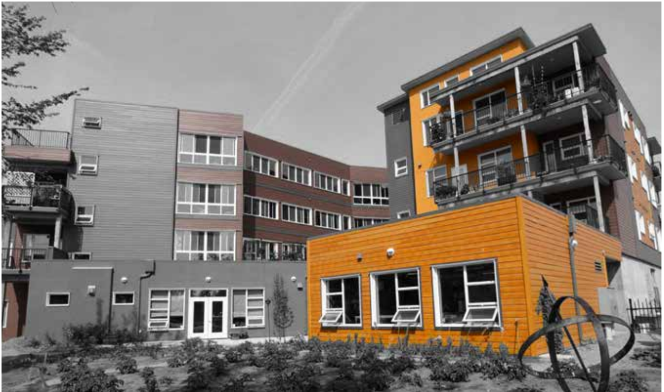
Wolf Willow Co-Housing Development (Award of Excellence, Architecture)