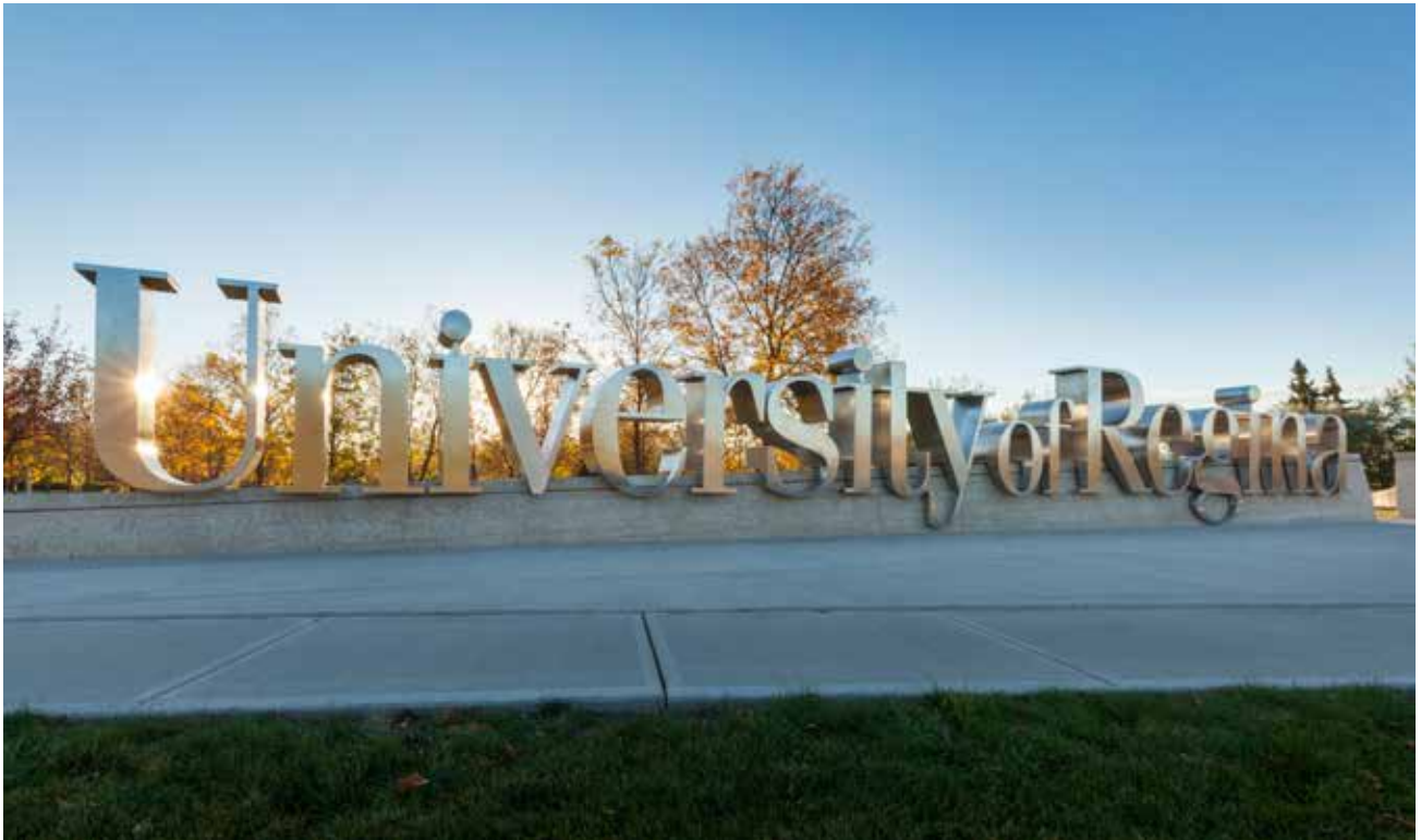
University of Regina Gateway Project (Award of Excellence, Integrated Design)