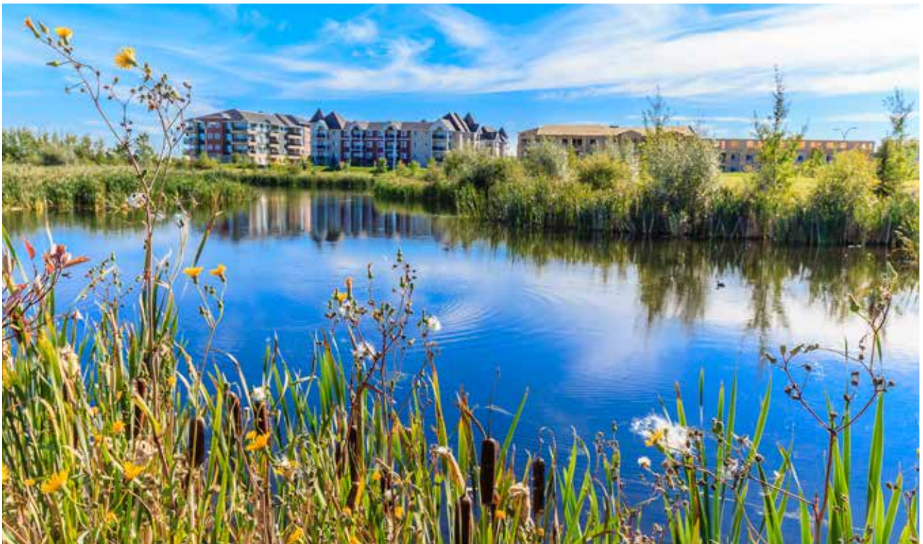
South East Park (Award of Excellence, Landscape Architecture)