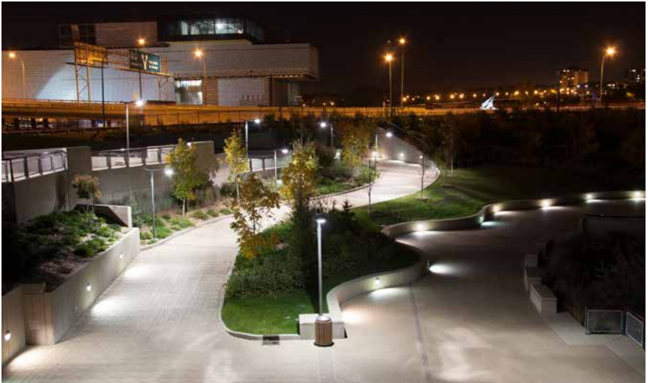
River Landing Riverfront Phase Two (Award of Excellence, Landscape Architecture)