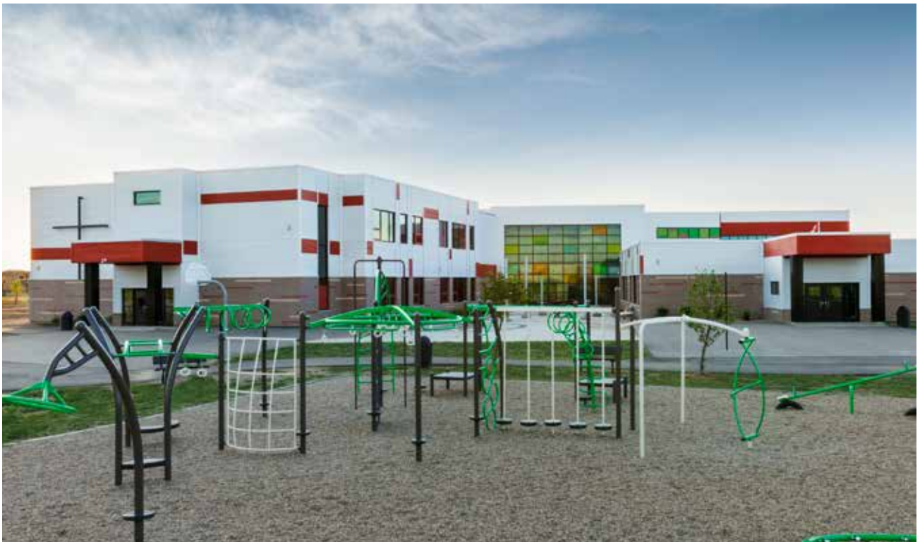
All Saints School (Joint-Use Project) (Award of Excellence, Architecture)