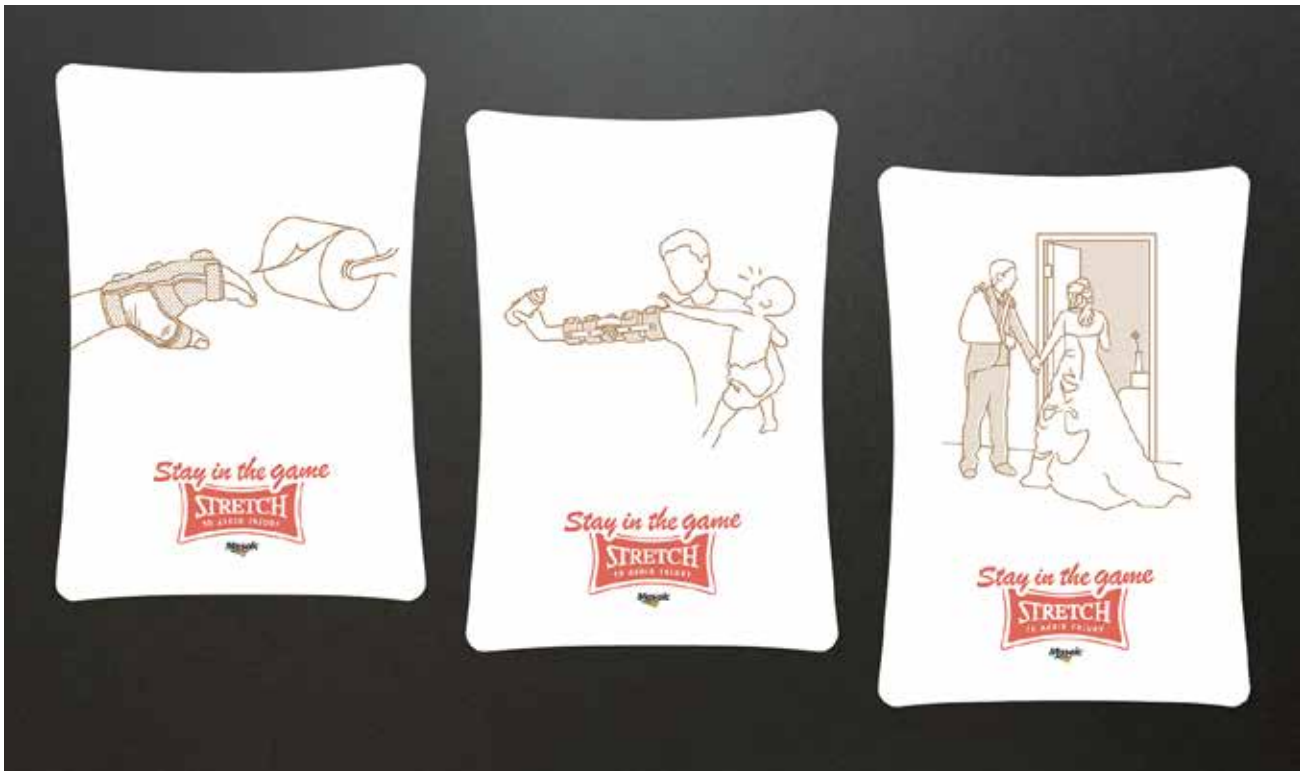
Stay in the Game: Injury Prevention Awareness Campaign (Award of Excellence, Graphic Design)