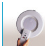
Ring Handheld Magnifier