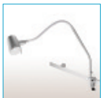
MT20 Exam Light