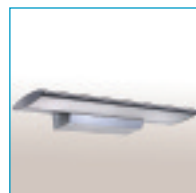
Amadea® Patient Room Wall Light