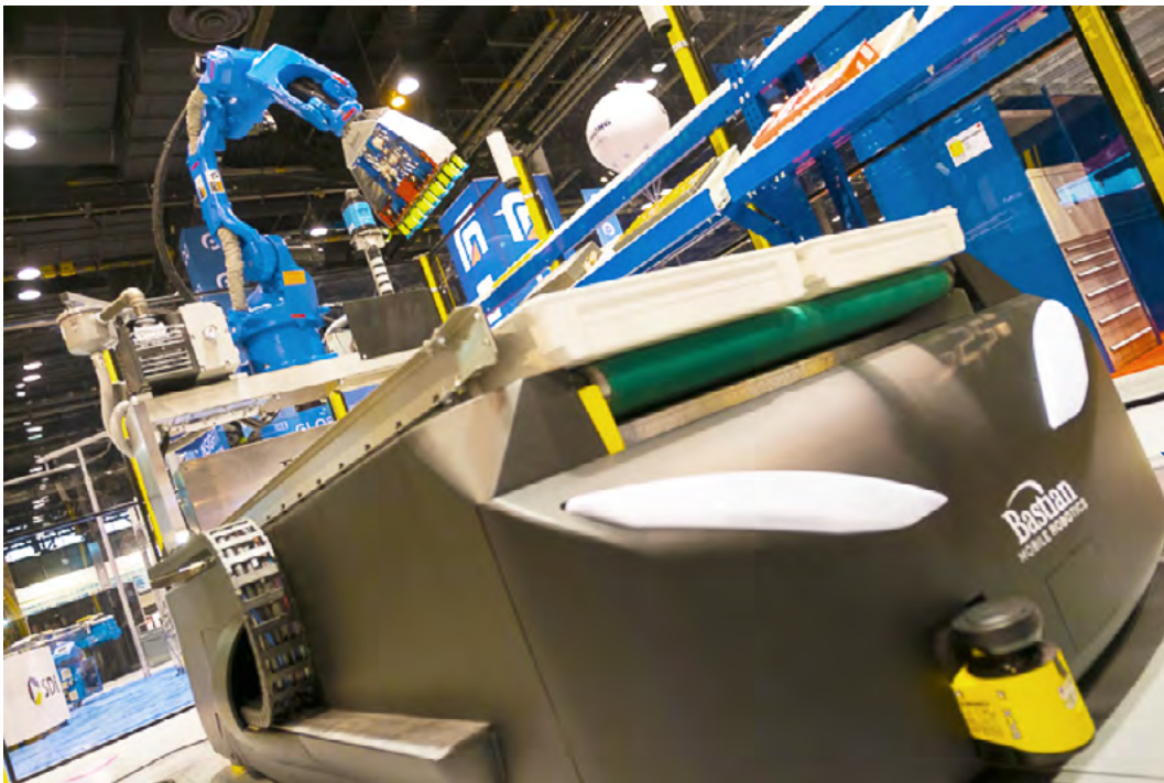
Batch Picking Mobile Robot, Courtesy of Bastian Solutions