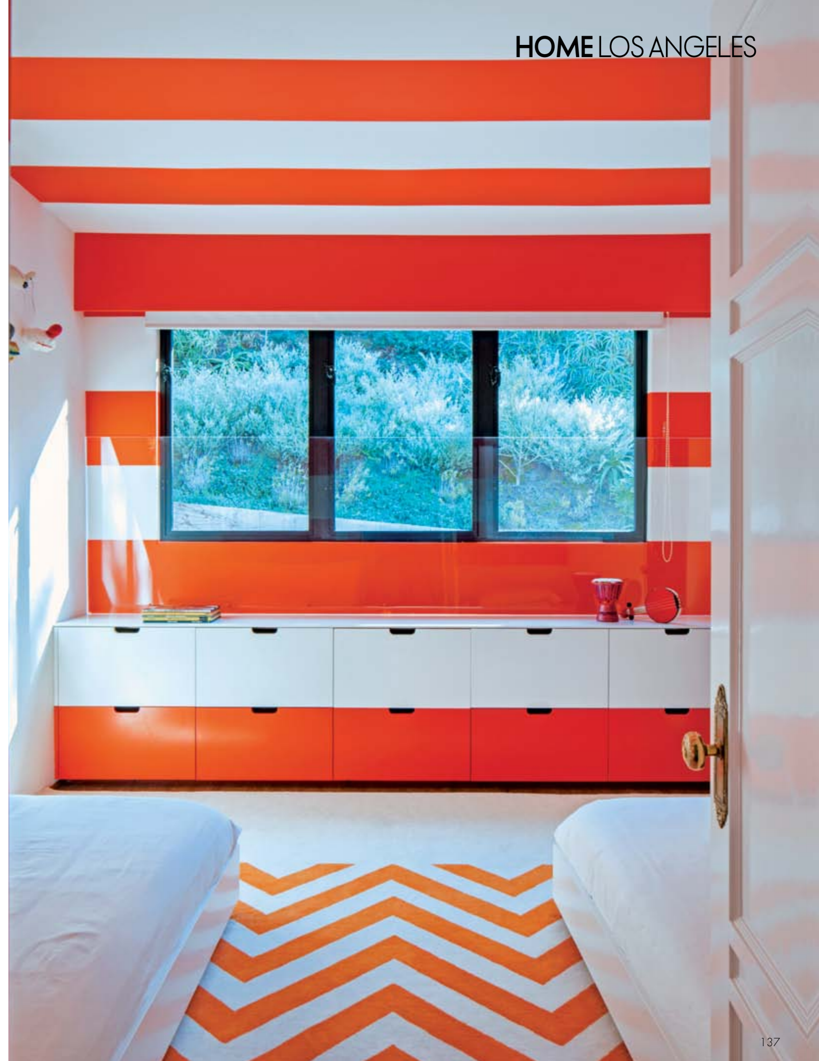
Clockwise, from Top Left The master bath features twin basins by Boffi affixed with faucets from Vola by Hastings Tile and Bath. The custom designed mirrored medicine cabinet by Chet holds a Mini Glo-ball light by Jasper Morrison for Flos; The orange room: Enthralled by colour the children call each room not by its function but by its hue; Alongside the pool on the terrace is Living Divani Pi-Air outdoor chaise lounges in matching turquoise; The iBride shelving unit in the kids’ playroom takes centre stage as Pipe lights by Herzog & DeMeuron for Artemide dangle above Right The kids’ bedroom on the second floor is primarily orange with a striped wall and chevron printed rug by Aronsons Floor Coverings