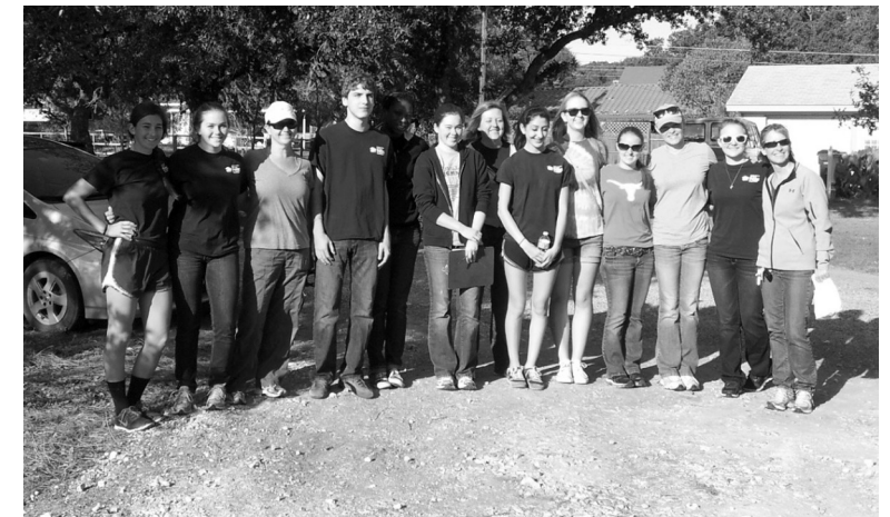
Volunteers from Dripping Springs High School

Newsletter photos: Wimberley Valley Habitat for Humanity appreciates photos from builds and events. If you're taking photos of WVHH builds or events, to be used in the newsletter, please be sure your camera is set at the highest resolution possible.