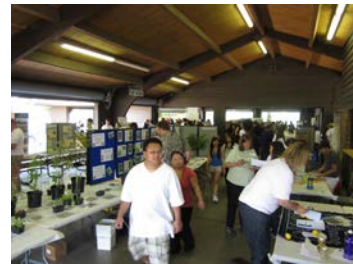
Hundreds of people attended RWMWD's WaterFest at Lake Phalen.

Student Programs: EMWREP participated in the following children's education events: