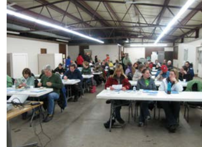
Above: Horse owners learned about protecting water resources.

Buckthorn Workshop: Held in Afton on April 5, this workshop provided residents with information about controlling buckthorn, replanting with native plants, and controlling runoff and erosion on wooded properties.