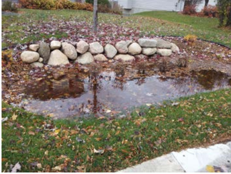
Above: One of the new Colby Lake raingardens shortly after planting.

Targeted neighborhood outreach: Last year, shared education staff conducted targeted outreach in Lake Elmo (VBWD), Stillwater's Lily Lake neighborhood (MSCWMO), and Woodbury's Powers and Colby Lake neighborhoods (SWWD). Outreach activities included mailings, open house events and door-knocking. As a result, 50 new stormwater retrofit practices will be installed in these four neighborhoods: