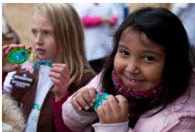
Woodbury Girl Scouts show off their new service event badges.

Girl Scouts 100 Year Anniversary Events: EMWREP helped Girl Scouts of the River Valleys' to plan community clean-ups for clean water to celebrate their 100-Year Anniversary. In the East Metro, Girl Scouts organized clean-ups near Forest Lake, Big Marine Lake, Square Lake, White Bear Lake, Lake Phalen, Beaver Lake, and at Ojibwe Park in Woodbury and Hamlet Park in Cottage Grove. Region-wide, girls marked 6,872 storm drains and distributed 50,000 door hangers. To learn more about the event, go to www.girlscoutsrv.org/about-us/girl-scouts-centennial/centennial-day-of-service .