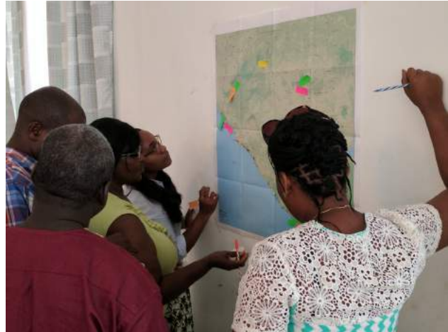
Above: Workshop attendees at the stakeholder workshop in Monrovia in December 2016 providing feedback on preliminary results.

Working in Liberia to incorporate the value of natural capital into public sector decision making: In addition to its regional work, the GDSA has facilitated the initiation of a pilot ecosystem accounting project between Conservation International (CI) and the Liberian Environmental Protection Agency (EPA). This project, was undertaken under the umbrella of the GDSA and was initiated in March 2016. Initial analyses were presented to the Liberian government in December 2016. These included preliminary forest and timber accounts as well as substantial work on mapping Liberia's biodiversity, forest carbon, and freshwater natural resources. The outputs of this work will be published in 2017 by CI and the EPA.