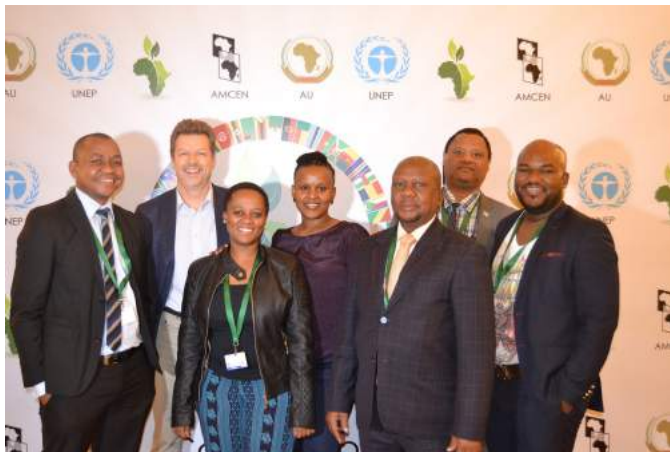
Above: GDSA at AMCEN.

Soliciting new members to the join the GDSA: In 2016, AMCEN (the African Ministerial Conference on the Environment) passed resolutions in support of GDSA's work on natural capital accounting and encouraging AMCEN members to join GDSA.