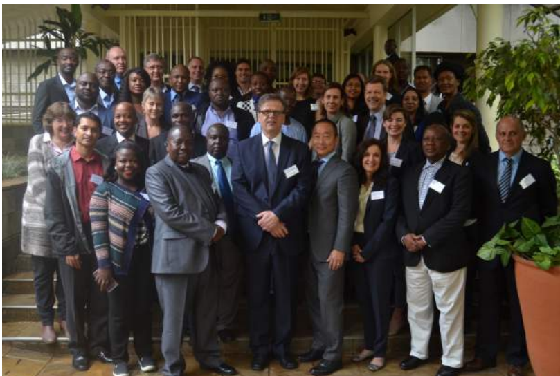
Left: Workshop attendees at the NCA workshop in Nairobi in June 2016.