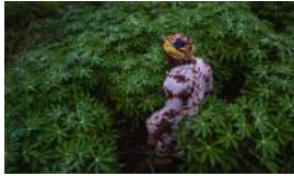
PAGE 3: MAINSTREAMING NATURAL CAPITAL INTO DECISION-MAKING.