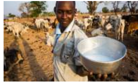
PAGE 4: PROGRESS ON SUSTAINABLE DEVELOPMENT.