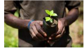
PAGE 6: SPREADING THE MESSAGE ACROSS THE GDSA.