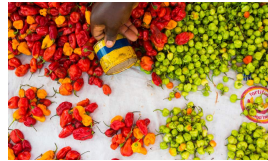
PAGE 5: DATA AND MONITORING FOR SUSTAINABILITY.