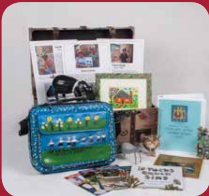
Folk Art Culture Kit

Hickory Museum of Art lends cultural kits FREE of charge to schools. HMA kits contain original pieces of art for discussion and display. Available culture kits: