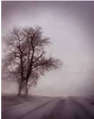
TODD HIDO American, b. 1968

Island Road, 2010 from The Island series, Isle de Jean Charles, Louisiana Archival Pigment Print 2010