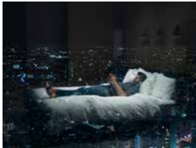
ALEC SOTH American, b. 1969

Park Hyatt Hotel, Tokyo Archival Pigment Print 2015/2018