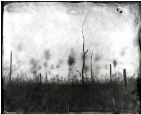
LISA ELMALEH American, b. 1984

Marsh Grass and Trees, New Jersey, 2008 Gelatin Silver Print 2008