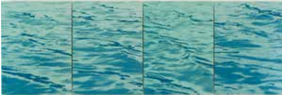
RAY CHARLES WHITE

Selenium Toned Gelatin Silver Print 2003