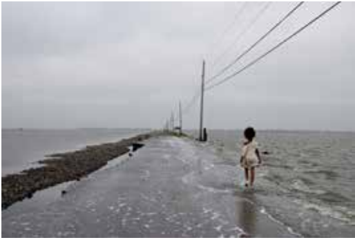
STACY KRANITZ American, b. 1976

Island Road, 2010 from The Island series, Isle de Jean Charles, Louisiana Archival Pigment Print 2010