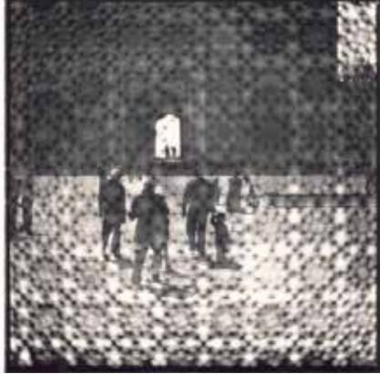
HIROSHI WATANABE Japanese, b. 1951

Habitation (Joyce's Sunroom) Archival Pigment Print from Negative 2004