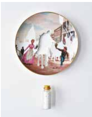
ELIZABETH ALEXANDER American, b. 1982

Snow White Inkjet on Canvas with Acrylic 2005