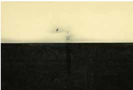
MASAO YAMAMOTO Japanese, b. 1957

#121 from A Box of Ku (bottle) Toned Gelatin Silver Print n.d.