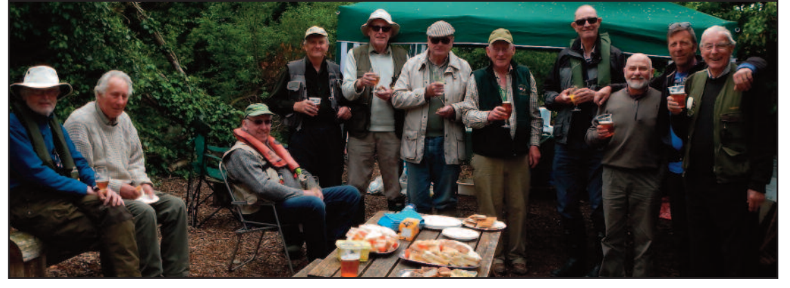
PICT with the Tringford crew