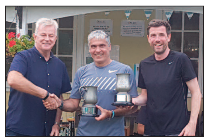
Penman Trophy Winners

Well the final was agreed as best of three sets, which my legs did not agree with but the mind was willing and having lost the final for the last three years it was not gonna happen again! In a very tight and tense match, we finally got our hands on those pewter jugs - thanks partner.