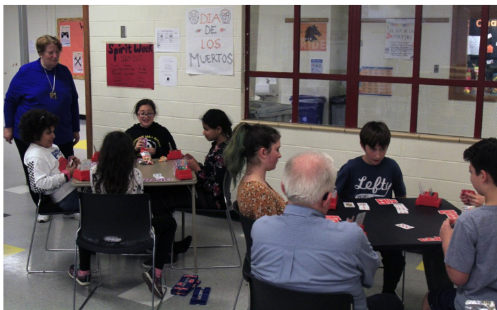
Teaching at McClure Middle School