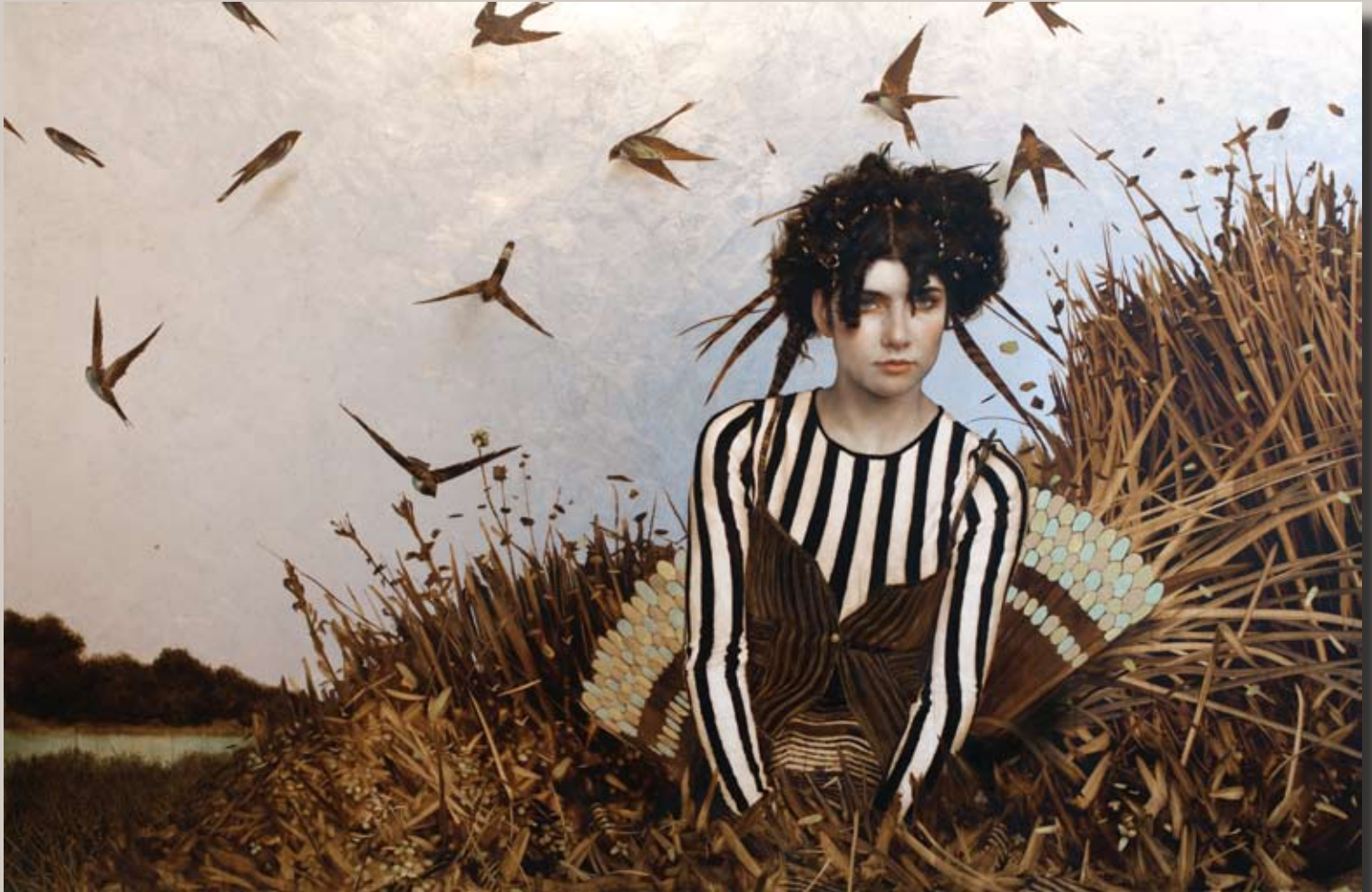
The History of Nature. Oil, gold and silver leaf on linen. 46 x 70 inches. 2014

We are always interested in failed projects and how one recovers from those. Do you have any instances of a fail and how you recovered, or how you found out what went wrong?