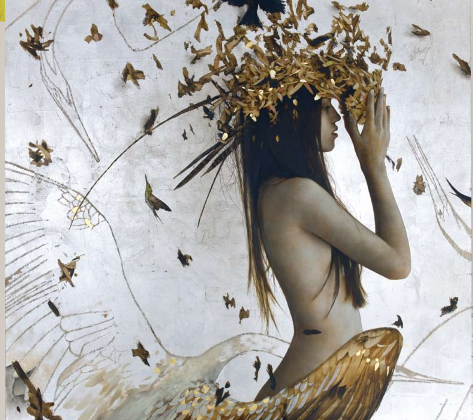
The Near, Far, and Leading. Oil, gold and silver leaf on linen. 35 x 32 inches. 2014

On the cover - Cocoon, Oil and gold leaf on linen. 30 x 56 inches. 2012. Private collection.