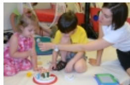
The Rauch First Steps Provider Network serves counties in Areas 4 & 5: Washington, Orange, Scott, Clark, Harrison, Crawford, Floyd