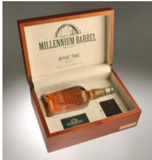
Rauch received bottle number 20 of Buffalo Trace's Millennium Barrel Bourbon.