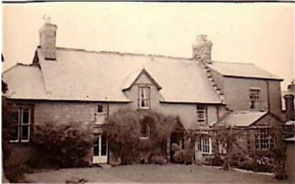
Photo - Brookfield House in 1940's - confusingly called Brook House before 1911 - as the house across the road.

Grade II Date Listed 2/1/1988 Record ID 7327