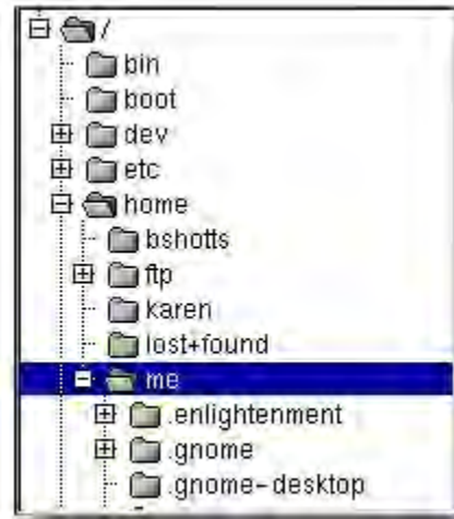
Figure 1: File system tree as shown by a graphical file manager

Imagine that the file system is a maze shaped like an upside-down tree and we are able to