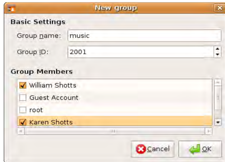
Figure 3: Creating A New Group With GNOME

The first thing that needs to happen is creating a group that will have both bill and karen as members. Using the graphical user management tool, bill creates a group called music and adds users bill and karen to it: