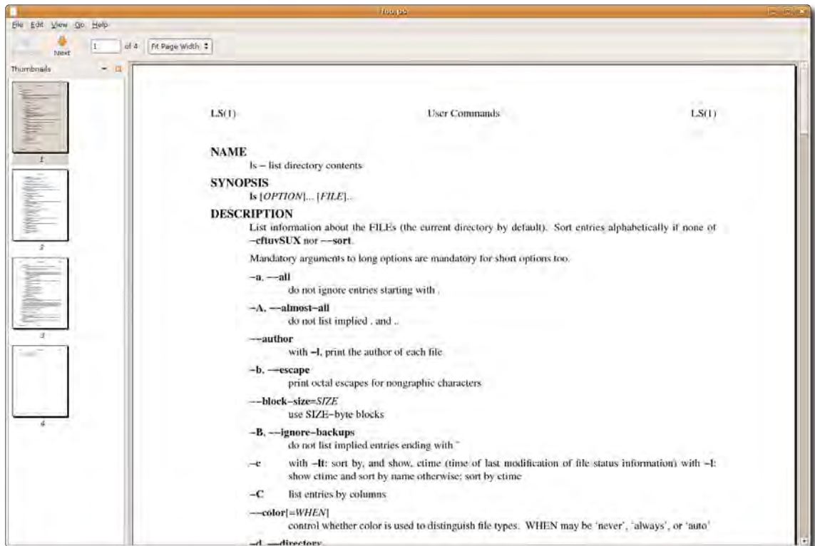
Figure 4: Viewing PostScript Output With A Page Viewer In GNOME

An icon for the output file should appear on the desktop. By double-clicking the icon, a page viewer should start up and reveal the file in its rendered form: