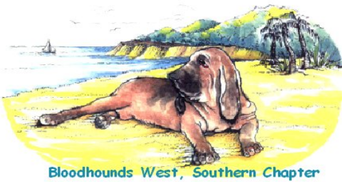
Bloodhounds West, Southern Chapter