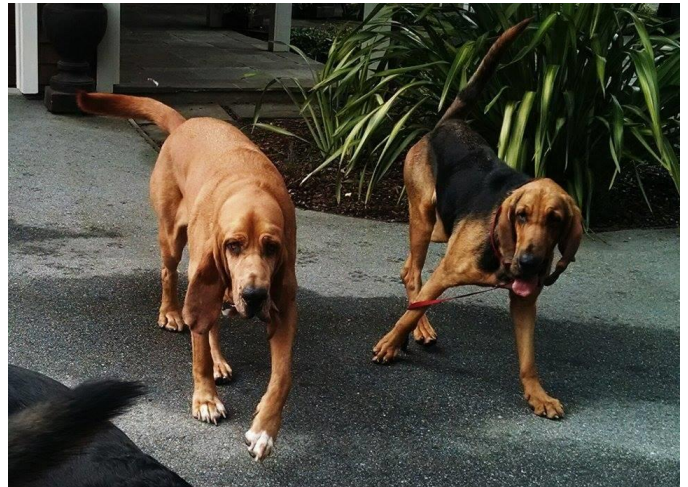
Wyatt on left and Lola on right

When a bloodhound comes our way in need of re-homing, our dedicated volunteers do what they can to assist the owner in need of surrendering.