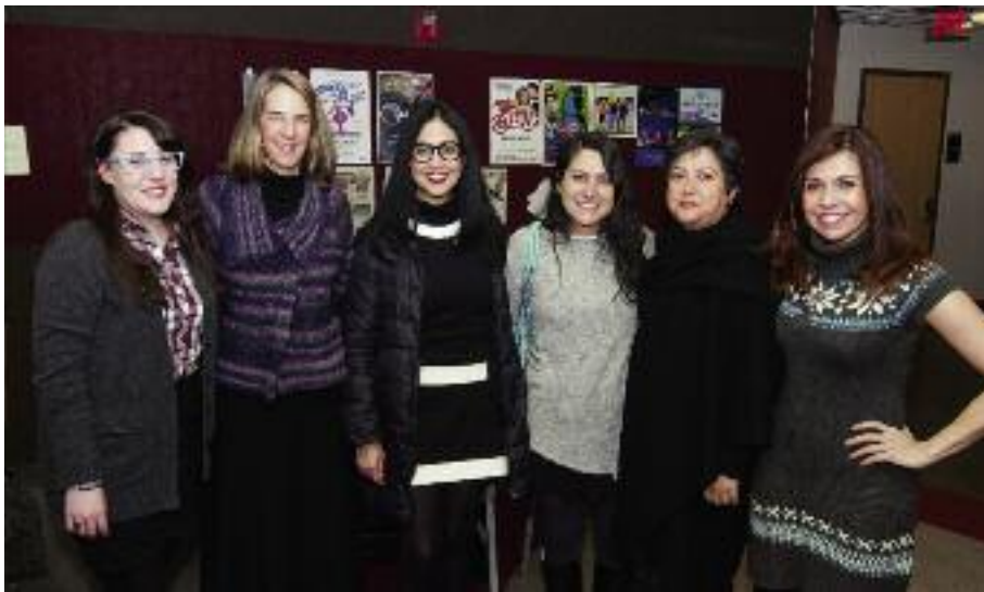
Part of a creative collaboration between Vanderbilt University's Center for Latin American Studies, Conexión Américas, and Nashville Opera included the screening of the film THE HOUSE OF THE SPIRITS at the Noah Liff Opera Center, January 8.

The concept of creative placemaking is deeply ingrained in the fabric and fiber of our city, largely because our leaders