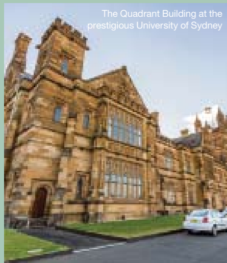
The Quadrant Building at the prestigious University of Sydney

They also vary a great deal in price – fees can range from A$3,000 (£1,631) per year to top schools costing up to A$28,000 (£15,230) per year!