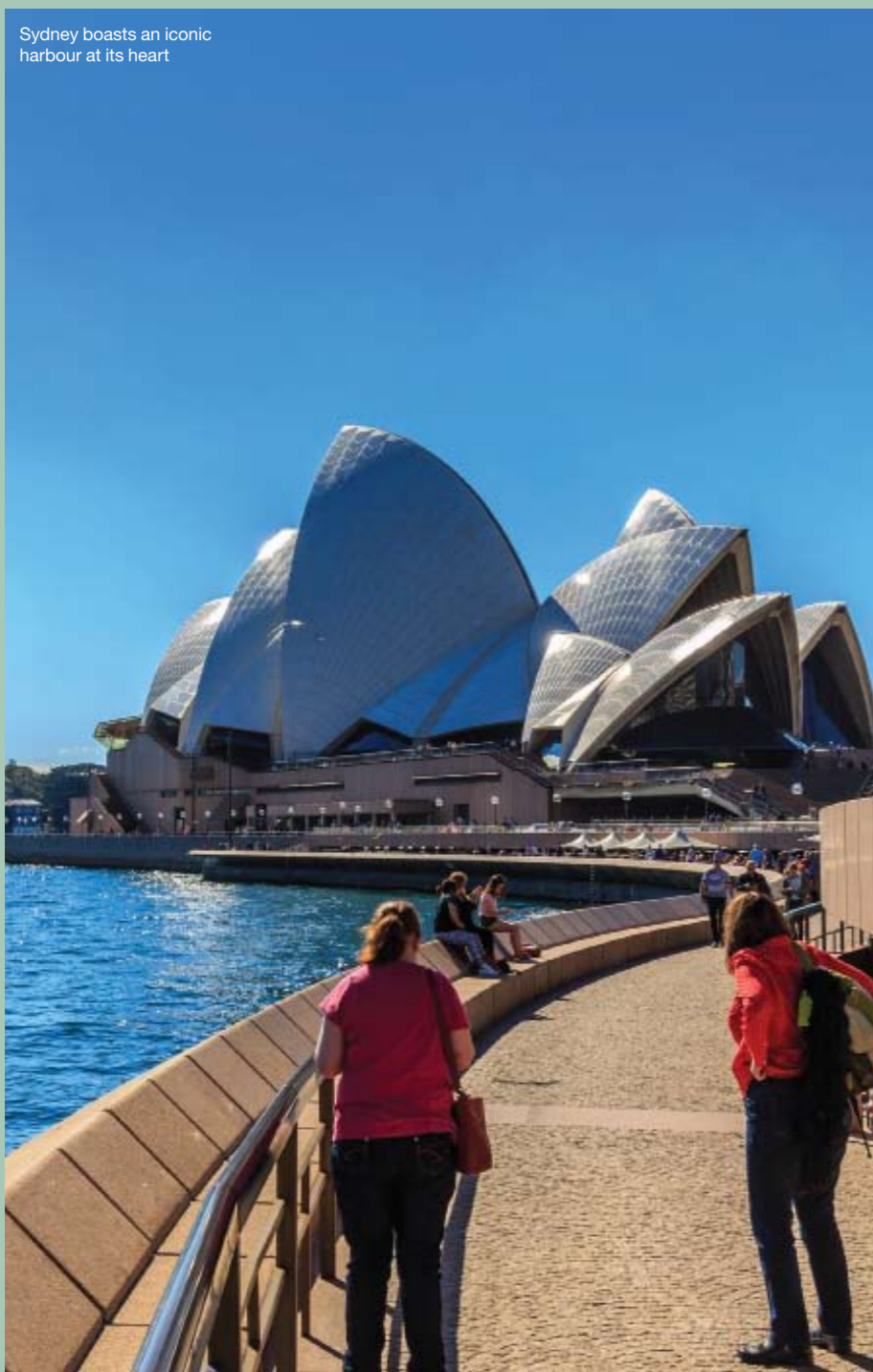
Sydney boasts an iconic harbour at its heart

It's no wonder so many UK migrants want to call Sydney home – this world class city has it all! Australia's largest city provides a cosmopolitan lifestyle with a beautiful climate, incredible beaches and a myriad of work opportunities.