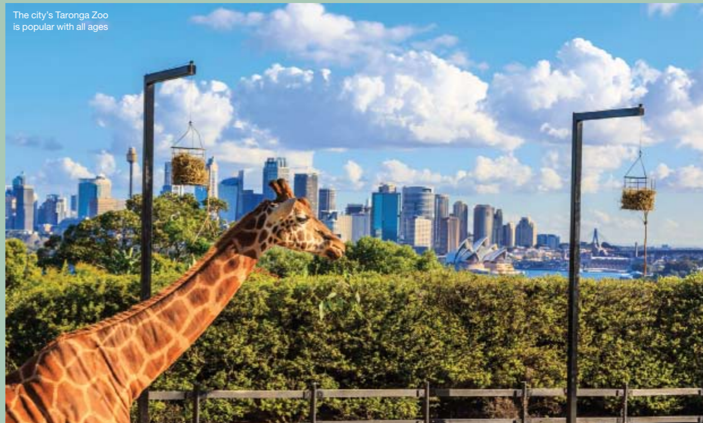
The city's Taronga Zoo is popular with all ages

South Wales (NSW) having the lowest rate of unemployment in the country.