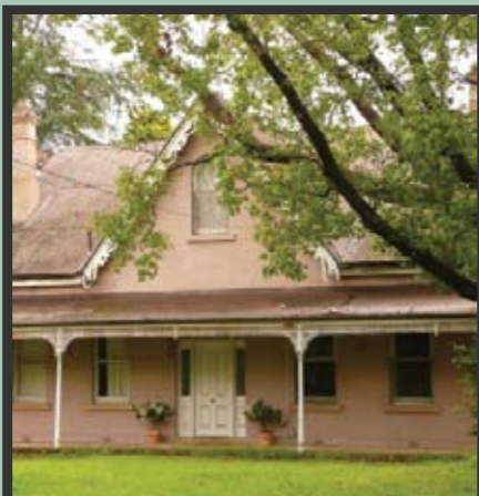
Family-friendly Castle Hill offers more affordable housing