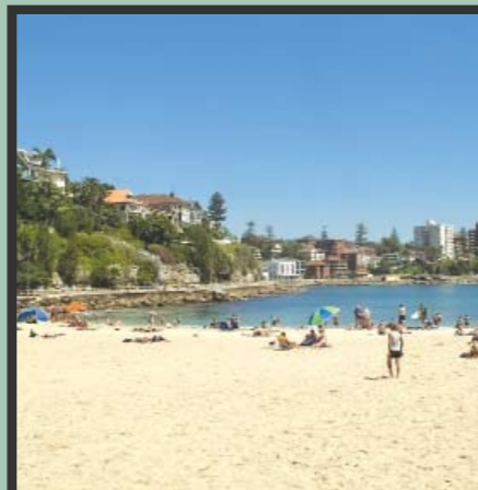
Beautiful Manly offers a more laid-back beachside lifestyle