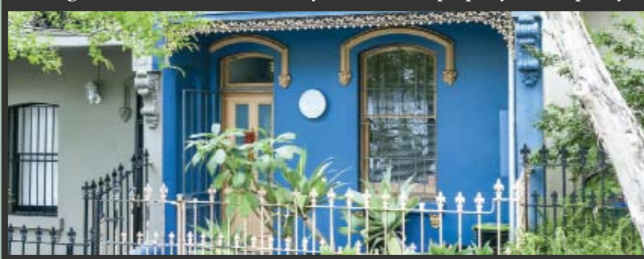
Paddington is an attractive inner-city suburb – but property can be pricey!