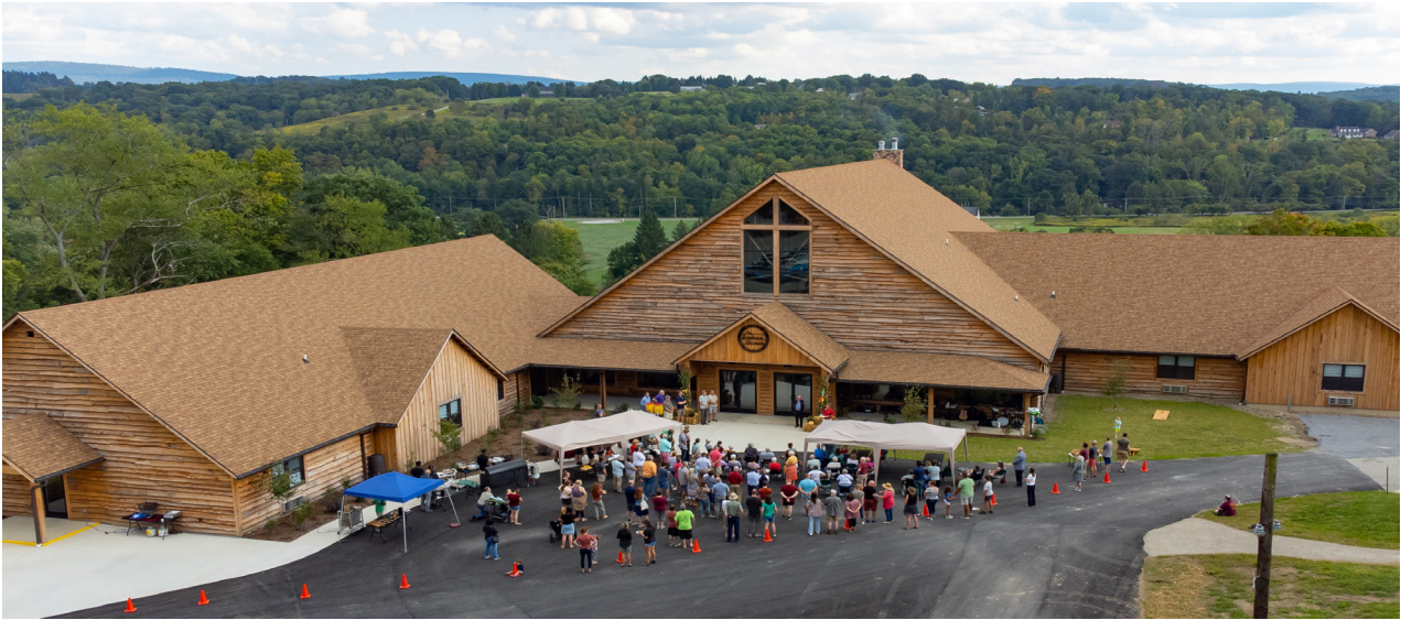
Joshua House dedication ceremony Sept. 18.

It is a breathtaking building that rises above the hills as you turn the corner on route 711 on your way to camp. From the moment you step into the building, you feel a desire to fellowship and gather as your eyes are drawn towards the welcome center and hospitality lounge sponsored by the Ligonier Valley Endowment. To the left is the Joshua